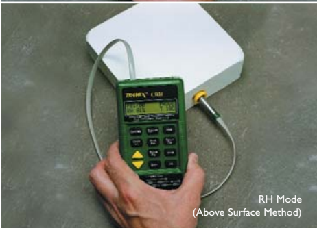
RH Mode (Above Surface Method)