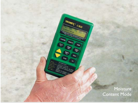
Moisture Content Mode

The world's most advanced MOISTURE and RELATIVE HUMIDITY Meter for the flooring industry, the Tramex CRH measures MOISTURE CONTENT , RELATIVE HUMIDITY , TEMPERATURE and DEW POINT in concrete and gypsum flooring.