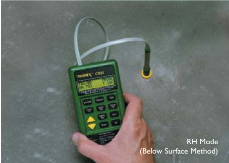
RH Mode (Below Surface Method)